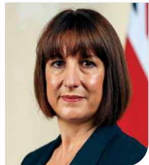
Official portrait of Rachel Reeves MP, by Lauren Hurley, licensed under Open Government Licence v3.0

The OBR, blushing from its pre-emptive publication of documents on the day, at least managed to summarise matters neatly: "...the Budget delivers a frontloaded increase in spending of £9 billion and backloaded increase in taxes of £26 billion".